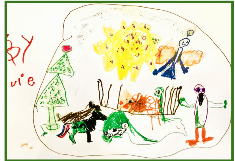
Artwork by Evie Brant (5)